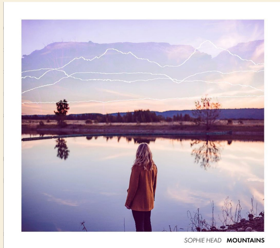
Single Cover Art for Sophie Head's "Mountains"