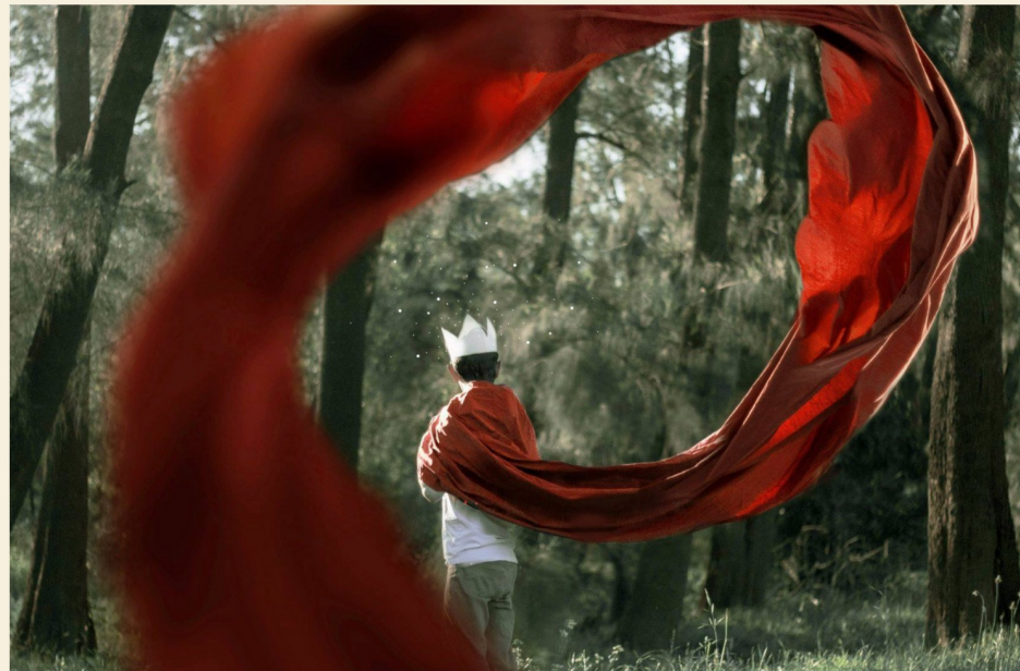
Self Portrait for Flickr 52 Weeks Project