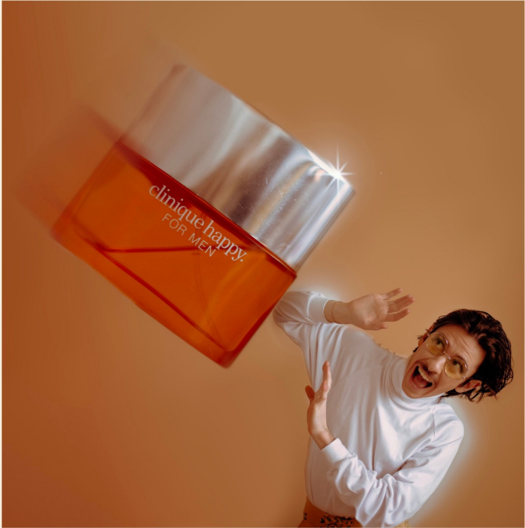
Happy! Concept campaign for Clinique