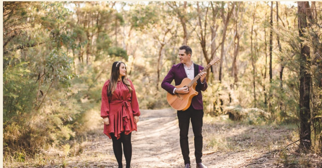
Brand Portraits for White Clover Music