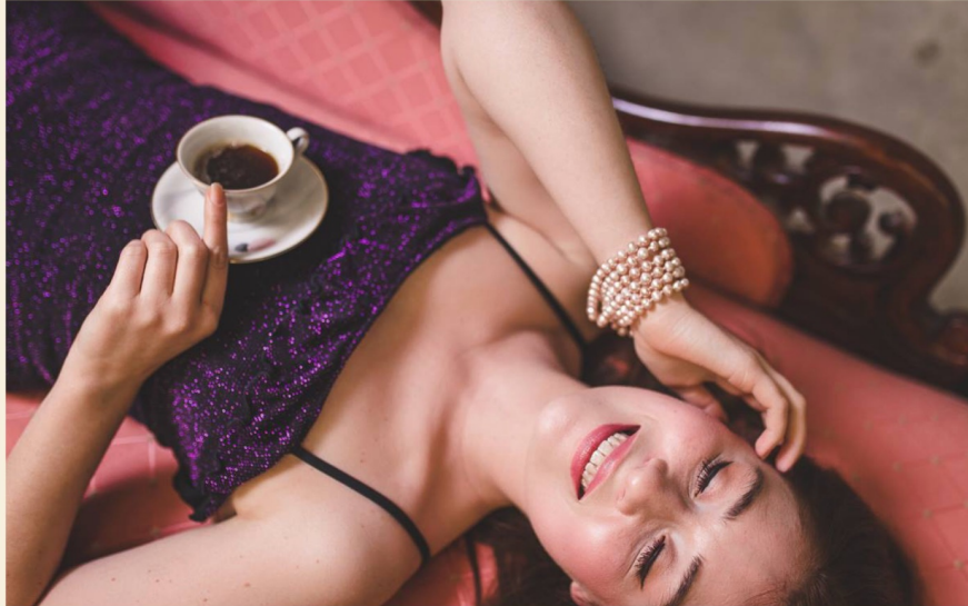
Editorial Campaign for Love Beans Coffee